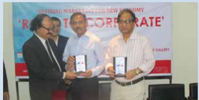
Career Seminar on Marketing

The School of Sales Management in association with East West University Career Counseling Center arranged a program on 20 th February 2019 at the S.M. Nousher Ali Lecture Gallery of East West University.