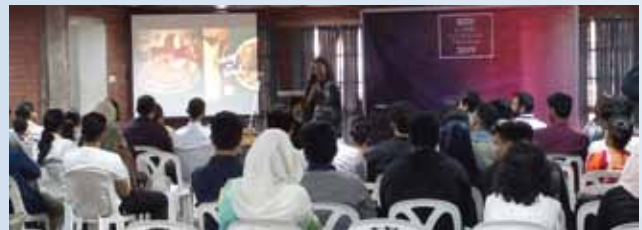
MGH Group Leadership Program

The Campus Road Show, a Leadership Program, organized by MGH Group in association with East West University Career Counseling Center, was held on 23 rd January, 2019. The road show provided a brief overview of career opportunities at MGH Group.