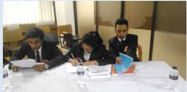
Team East West in K. Mahbubuddin Ahmed Memorial Competition

The School of Law, BRAC University, organized an Inter-University Moot Court Competition in the national level at the campus auditorium of BRAC University on 25-26 th January 2019.