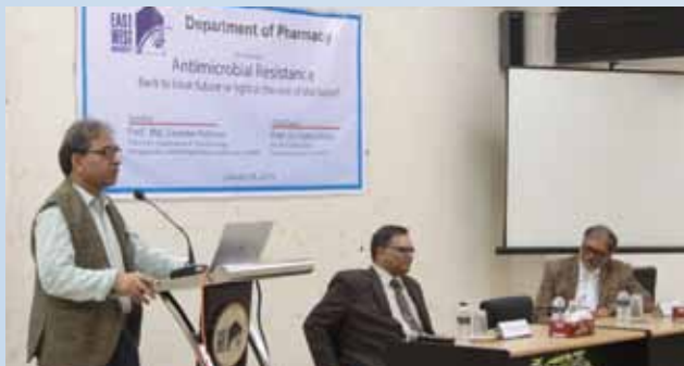
Seminar on “Antimicrobial Resistance: Back to bleak future or light at the end of the Tunnel?”