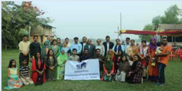
Annual Picnic 2019 (DSR)

• An annual picnic was arranged on 2 nd February 2019 for the faculty members, postgraduate students, teaching assistants and staff members. The destination was Arshinagar Holiday Resort of Gazipur. After the evening tea, the picnic team headed back to East West University and reached safely by 8.00 pm.