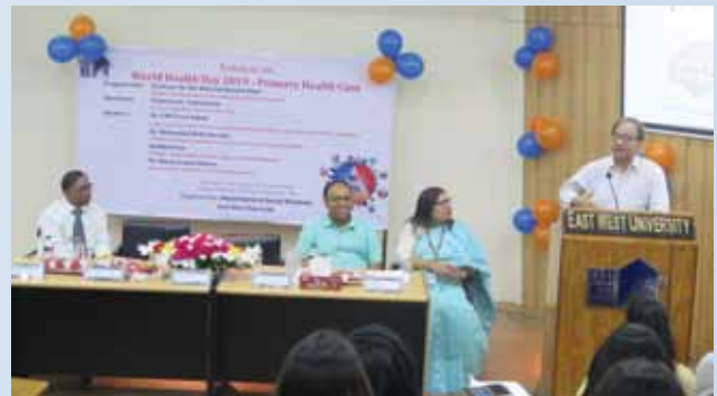
World Health Day seminar

The Department of Social Relations of East West University (EWU) organized a seminar on World Health Day 2019 at the S. M. Nousher Ali Lecture Gallery on 07 April 2019. The seminar highlighted this year's theme 'Primary Health Care'.