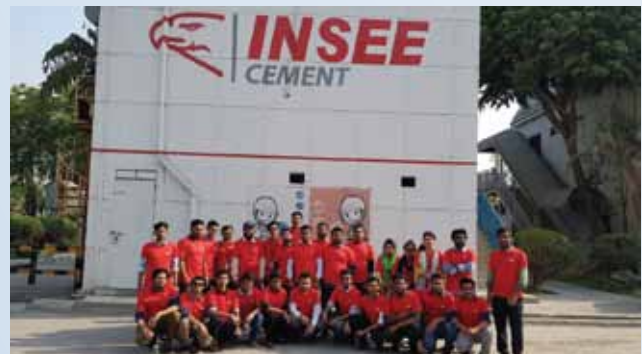
Study tour at Siam City Cement Plant, Madangonj, Bandar Narayanganj.

In Spring 2019, one of the rising cement companies of Bangladesh, Siam City (INSEE), invited department of Civil Engineering to visit their cement plant located at Madangonj, Narayanganj. The tour was held on March 23, 2019. A total of 30 students participated in this tour. Two faculty members and one lab officer guided the students during this trip. The tour comprised of both presentations and factory visit to the cement plant. The practical knowledge gained by the students through this visit will help them better understand the different steps in the production of cement in Bangladesh.