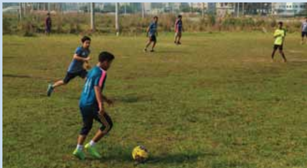
3 rd Intra EEE Football Tournament 2019

Students and Alumni of EEE department organized the 3 rd Intra EEE Football Tournament on March 15-17, 2019. A total of 11 teams participated in the event. The tournament was held at Aftabnagar sports ground.