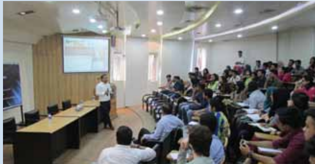
Motivational Workshop on INDUSITY (Industry+ University)