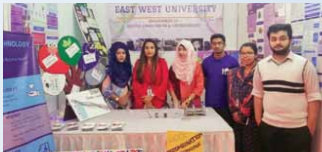
Faculty member and students of GEB department at BCSIR

The purpose of the conference was to create mass awareness about Biotechnology education, research, and expansion of biotechnology related business and products.