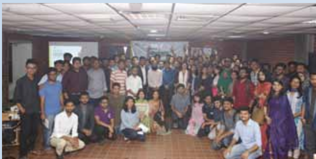
Student to Startup: Chapter-1

ICT Division has taken initiatives to promote Entrepreneurship and startup culture among the university students.