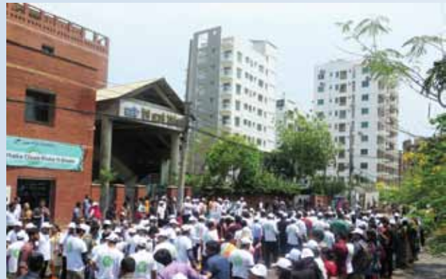
Cleanliness Campaign at EWU