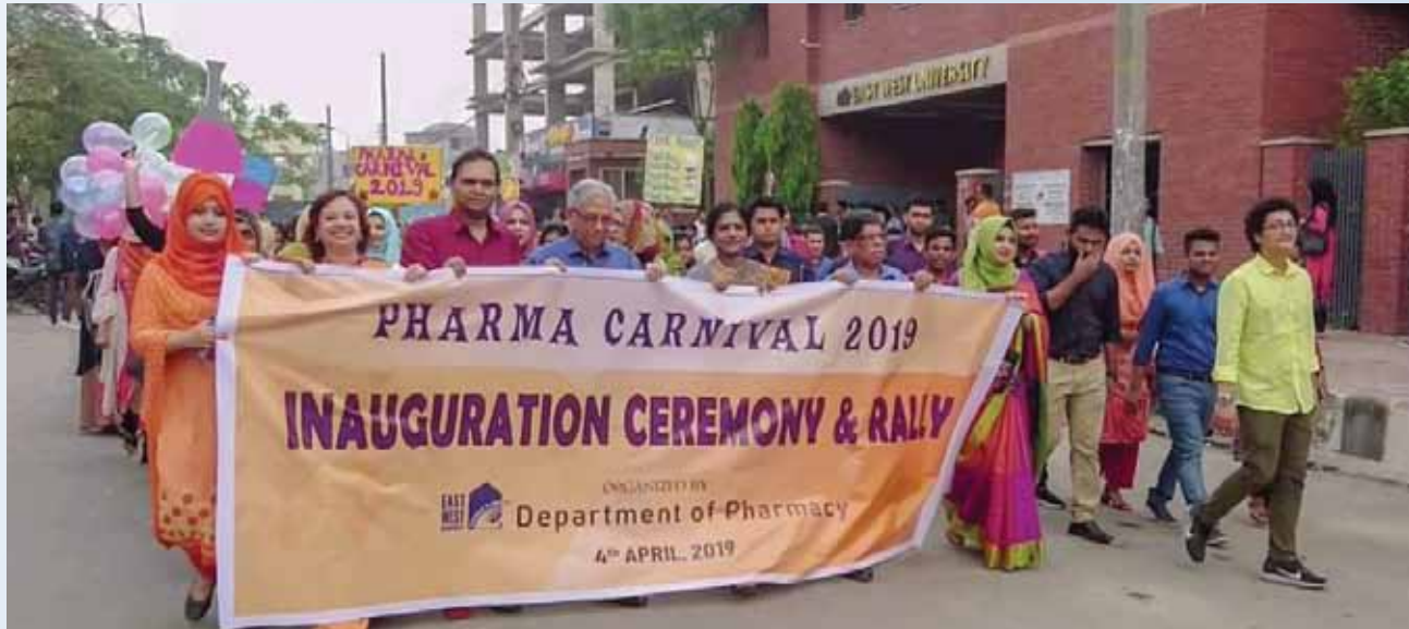
Pharma Carnival 2019 Inauguration Rally

As part of the carnival, the department organized a seminar titled “Bangladesh Pharma Industry: Growth, Opportunity and Challenges” on 11 April 2019, the closing day of the carnival.