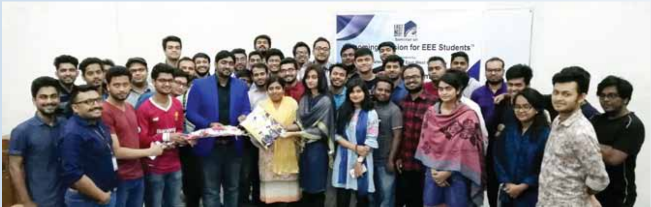
Grooming session for EEE students