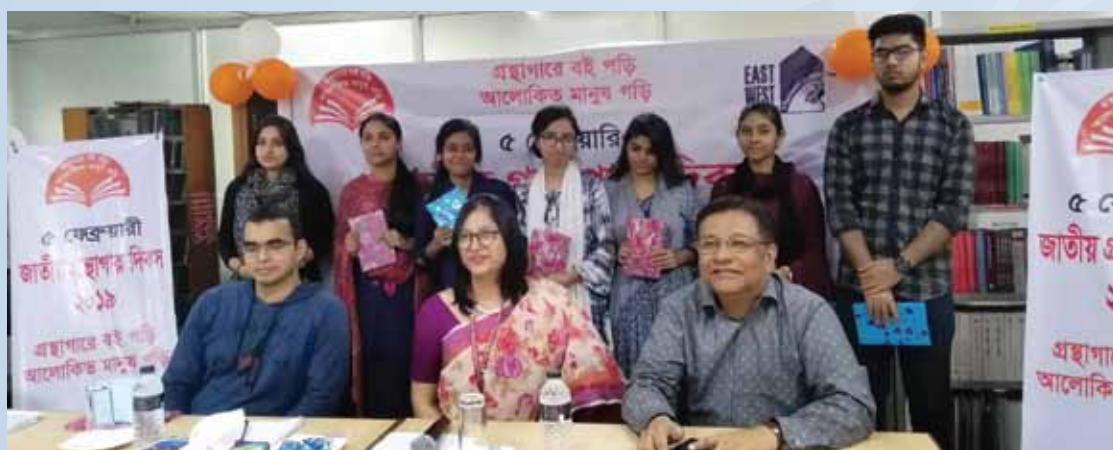
Winners of the best library users and quiz contest