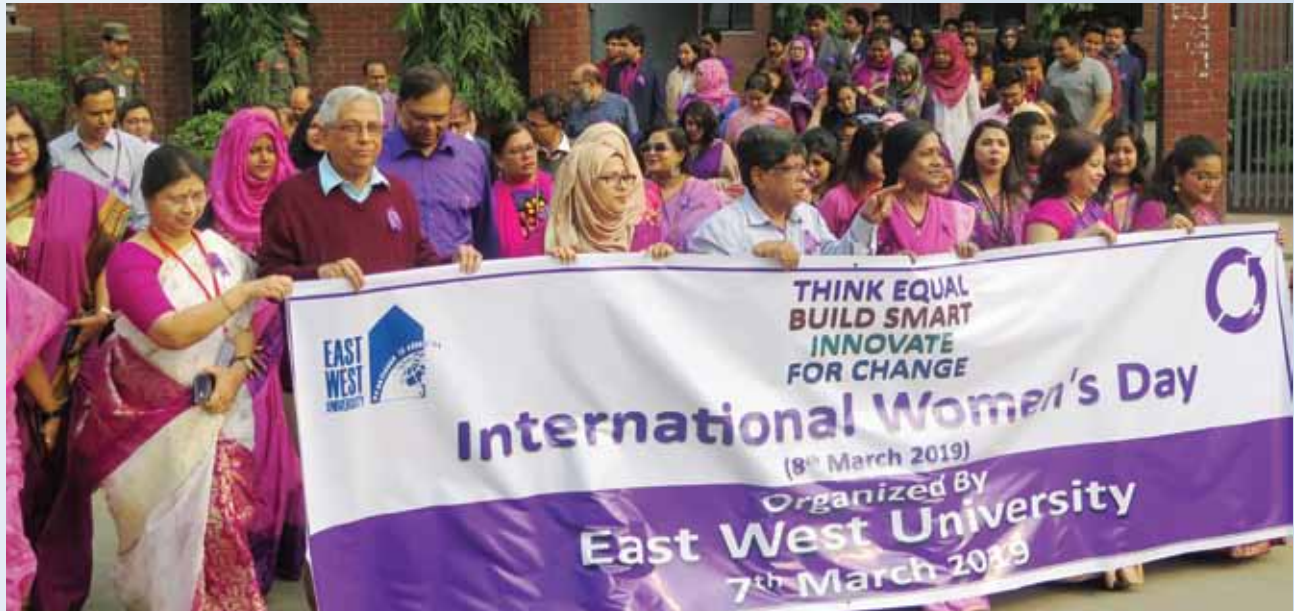
Women's Day Rally