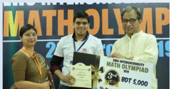
Math Olympiad, 2019