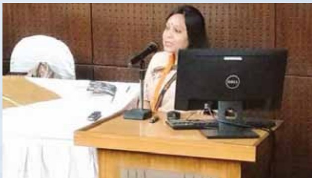
International Conference 'Gobeshona 5' Session 17