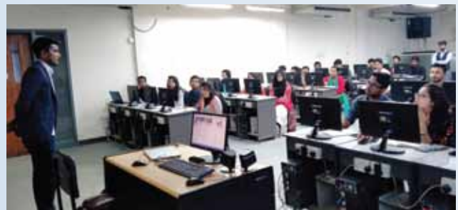
Creative IT Institute's- Training on Graphics Design

Creative IT Institute of Bangladesh, in association with East West University Career Counseling Center, organized a two-day training session on graphics design at the EWU campus. The training started from March 1 and ended on March 2, 2019. 45 students attended the graphics design training. The topics covered in the training were: Graphic Design Elements, Brand Design, and Freelancing Opportunities.