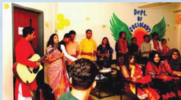
The Farewell Program of the Department of Sociology, Spring 2019

Department of Sociology organized a Farewell program. 26 graduate students expressed their feelings and shared their memory to show