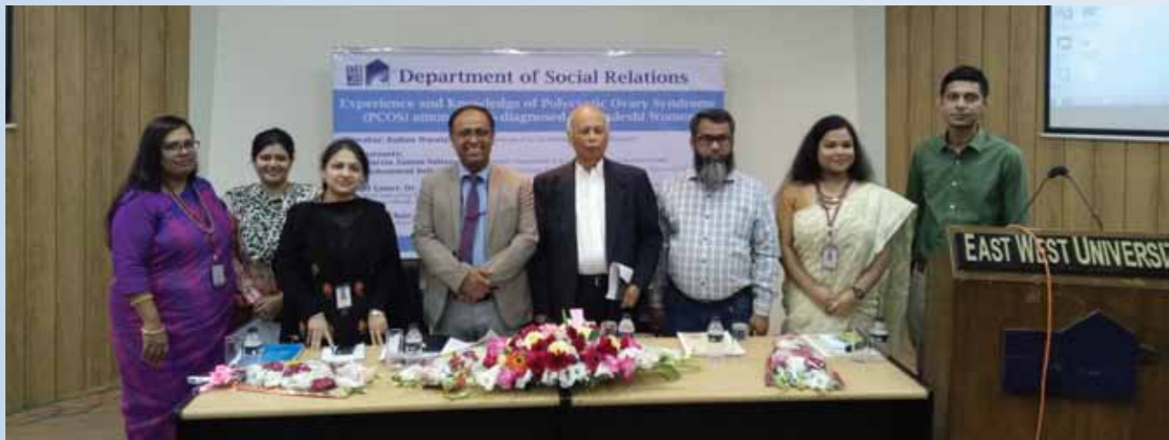
Seminar on Polycystic Ovary Syndrome (PCOS)

The speaker discussed PCOS and the level of knowledge of PCOS among PCOS-diagnosed Bangladeshi women.