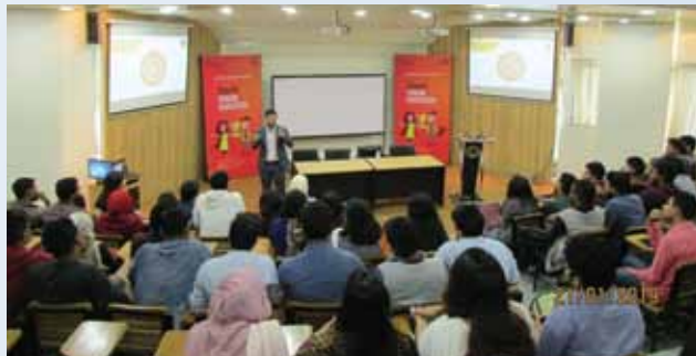
Strategic Assistant Program 4.0 (Management Trainee Program); Knowledge Sharing Session by Banglalink

Bangladesh team members conducted a one-hour session in the campus. To promote and familiarize students with the "Strategic Assistant Program 4.0". Around 100 students were present on that program.