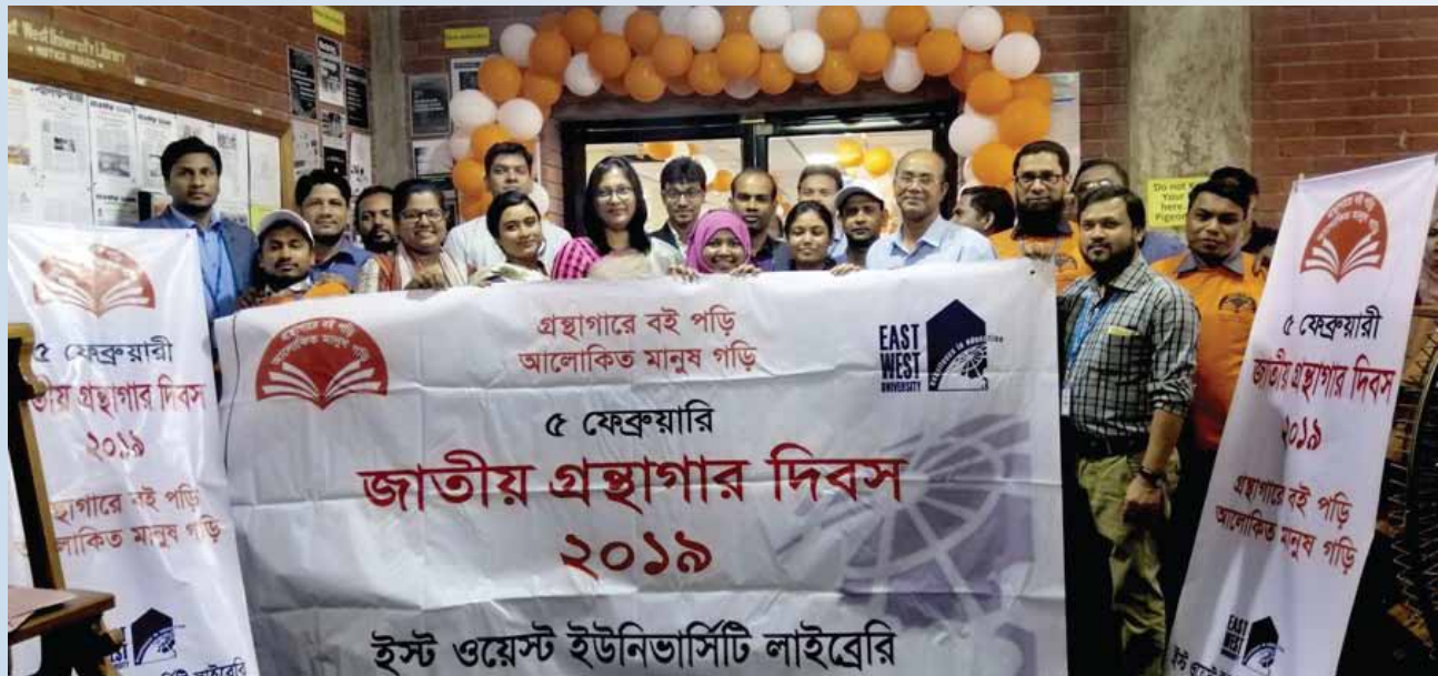
Inaugural rally of National Library Day 2019

in lifelong learning. EWU Library arranged the following activities on this occasion: