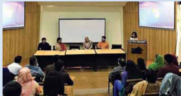
Department of Sociology Organized Teachers-Parents Students Meeting

Department of Sociology organized a parents meeting for the newly admitted students for Spring Semester 2019. The program was held in the S. M. Nousher Ali Lecture Gallery of East West University campus at Aftabnagar, Dhaka on 12 th February 2019. Approximately 30 students with their parents attended the program.