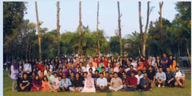
Economics Department Annual Study Tour 2019

Economics department of East West University organized a day long study tour on March 8, 2019 for the students of Economics department.