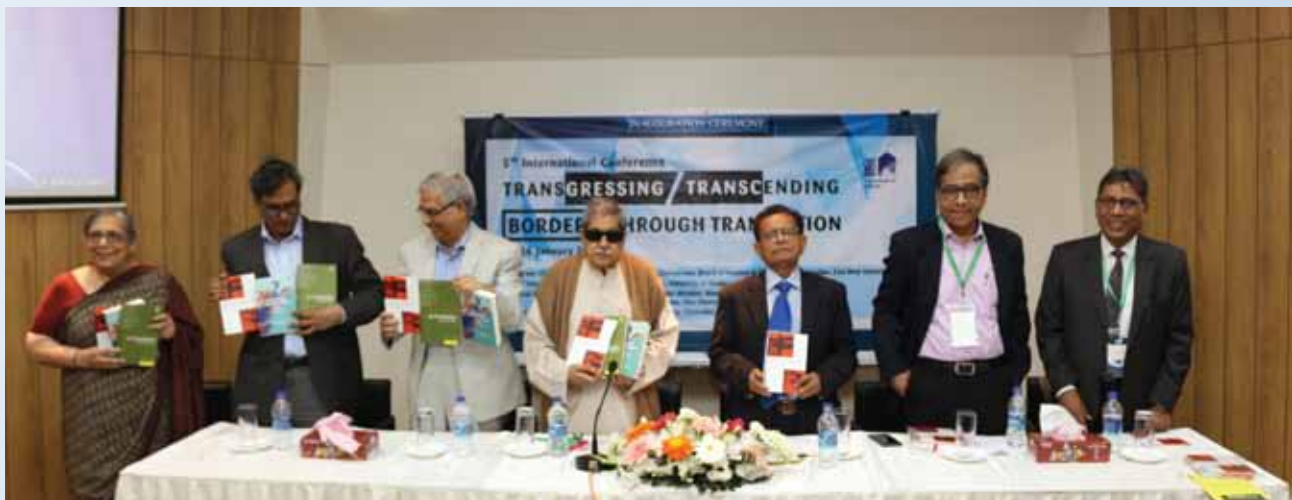
Launching of Books during the Inauguration Ceremony of International Conference