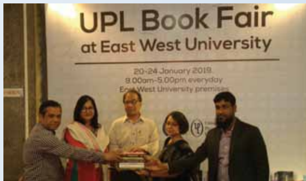
Book donation ceremony by UPL