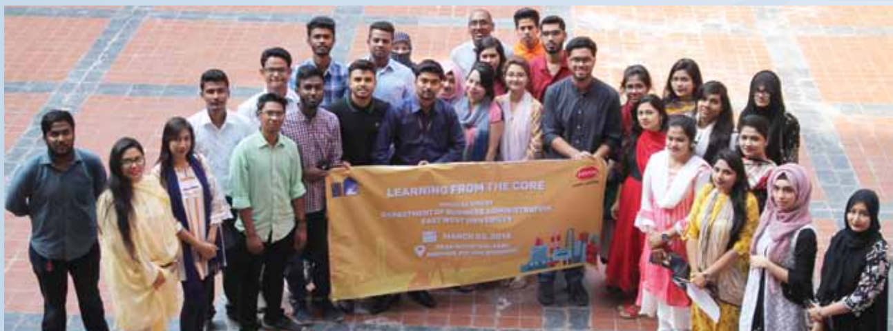
Industrial Tour to PRAN Industrial Park