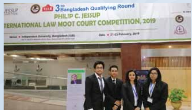
EWU Moot Team participated in the 'Phillip C. Jessup Moot Court Competition 2019, 3 rd Qualifying Round'