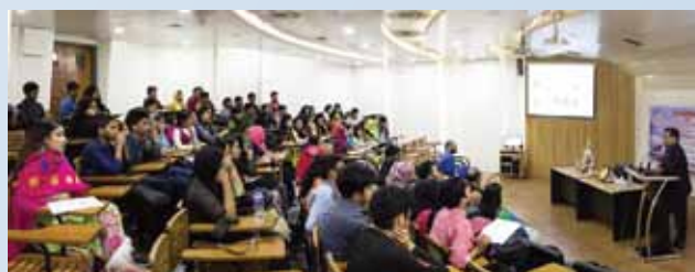
Seminar speaker and students and faculty members of GEB department

The speaker focused on how the Biopharmaceutical sector is considered as one of the fastest growing sectors in the pharmaceutical industry worldwide as well as in Bangladesh and encouraged the GEB students to develop their career in Biopharmaceutical industries.