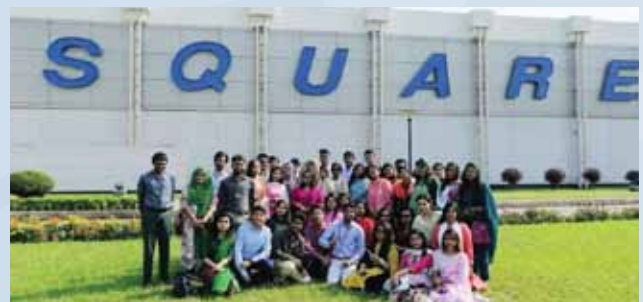
Industry Visit to Square Pharmaceuticals Ltd.

The students visited the Warehouse, Production (Solid and Parenteral dosage forms) and Packaging area, and thus gained insight into critical manufacturing and quality control processes of pharmaceutical products.