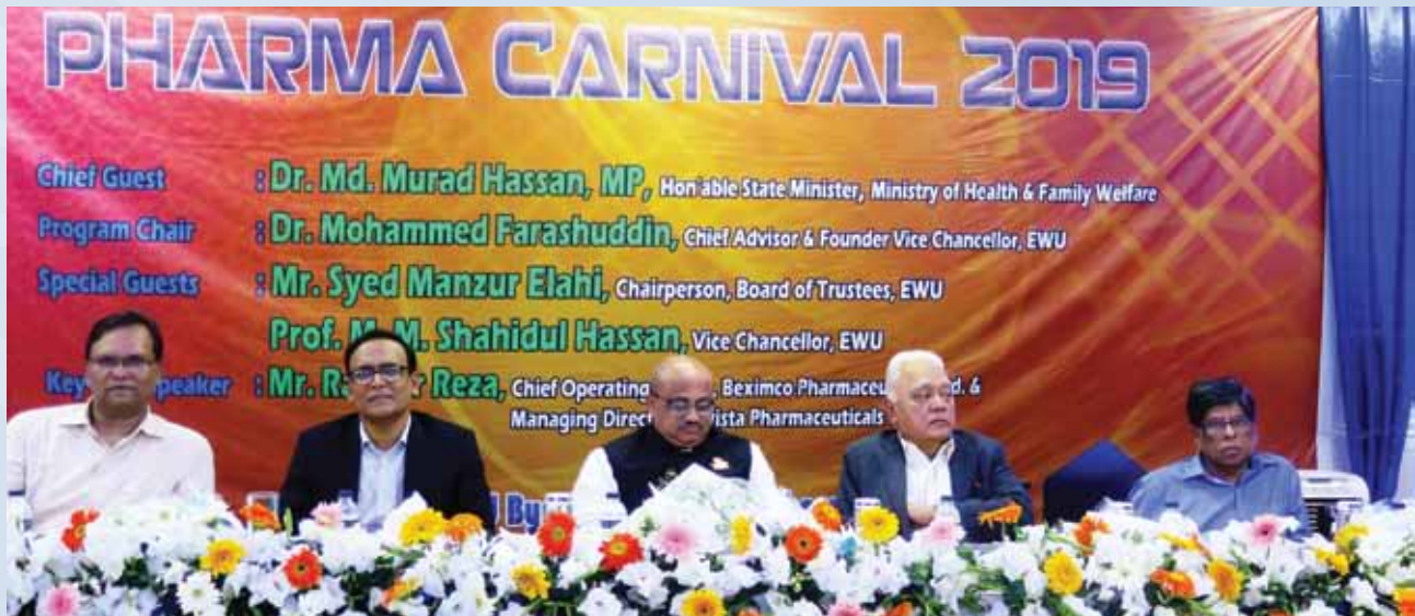
Pharma Carnival Closing Ceremony