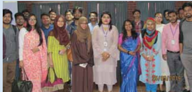
Innovation Hub by iLab at EWU

a2i, in coordination with Career Counseling Center, EWU organized a session for enhancing the activities of innovation hub at EWU on 25 March 2018. Access to information in Bangladesh (a2i) is a UNDP and USAID-supported Access to Information Programme run from the Prime Minister's Office of Bangladesh.