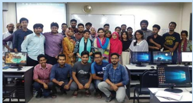
A photograph of Workshop on Web Design