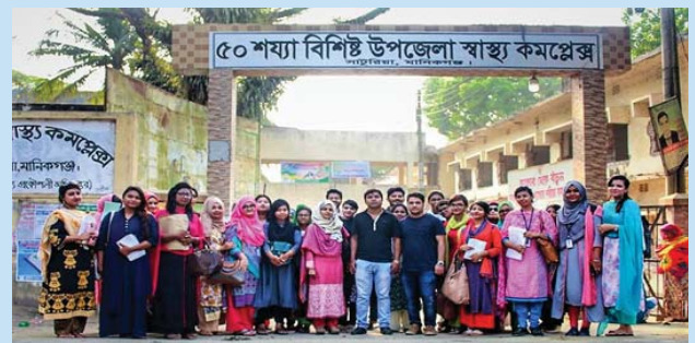
Field Trip, Medical Sociology, 2018

A field visit was organized for the students of Medical Sociology (SOC 305) on 24 March 2018 at Satoria, Manikganj.