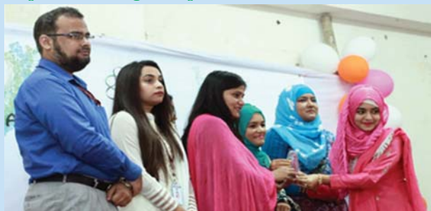
Award Giving of Popular Writing Competition 2018 on Biological Science