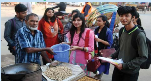
Image: Providing basket to street a street food shop

The club organized their usual program “Green Clean Promise”, they gave dustbins and gloves to the street food shop around the university campus to ensure hygienic food awareness through posters.