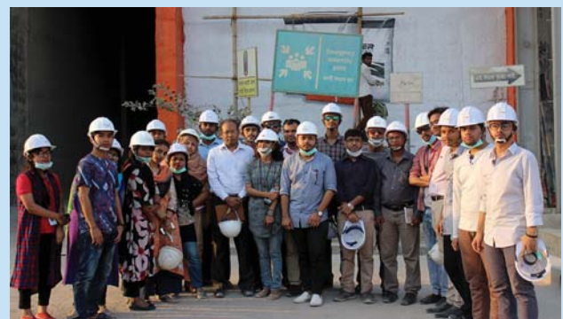
Study tour at Madina Cement Industries, Meghnaghat, Sonargaon, Narayanganj

The Department of Civil Engineering arranged a study tour to Madina Cement Industries, Meghnaghat, Sonargaon, Narayanganj for the students enrolled in Engineering Materials (CE 201) course. The tour was held on 4 March 2018.