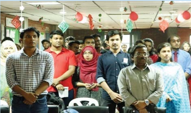
Everyone showing respect during the National Anthem.