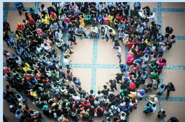
Flash mob performance by Bangladeshi band- Lalon and Young Bangla organizers

iconic speech given by the Father of the Nation Bangabandhu Sheikh Mujibur Rahman on 7 March 1971, at Ramna Race Course in Dhaka.