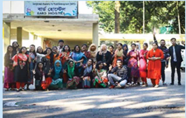
Field Visit of Gender Analysis and Gender Planning

During this two days field stay students also visited War Cemetery, archaeological site of Mainamati, Mainamati Museum, Bangladesh Academy for Rural Development (BARD) and they stayed night at BARD hostel.