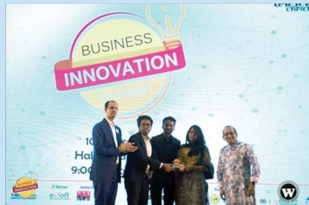
EWUCMC receiving the award

East West University Creative Marketing Club was awarded as one of the best partners by Bangladesh Innovation Forum on 10 March 2018 at "Business Innovation Summit 2018."