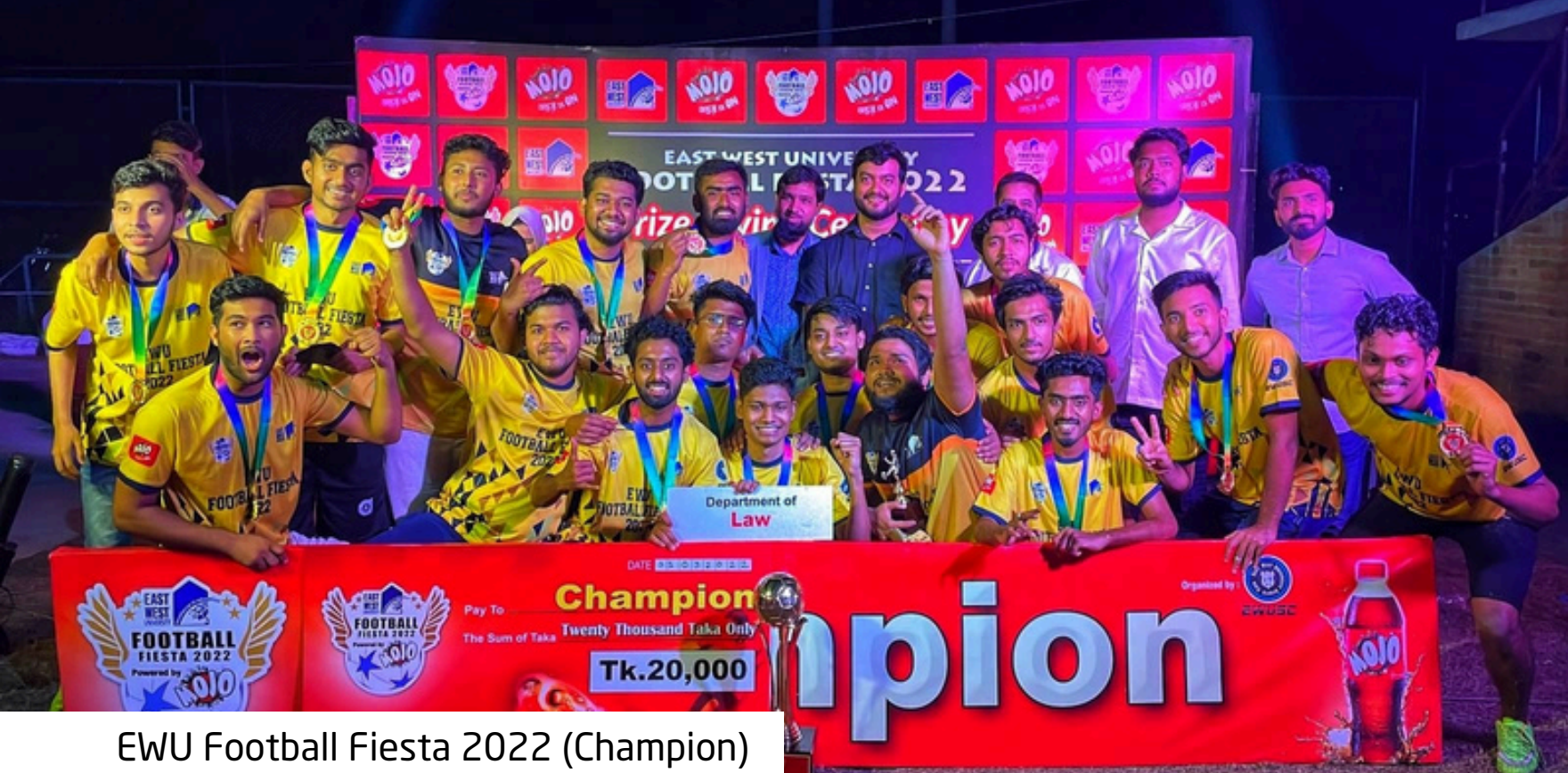
EWU Football Fiesta 2022 (Champion)