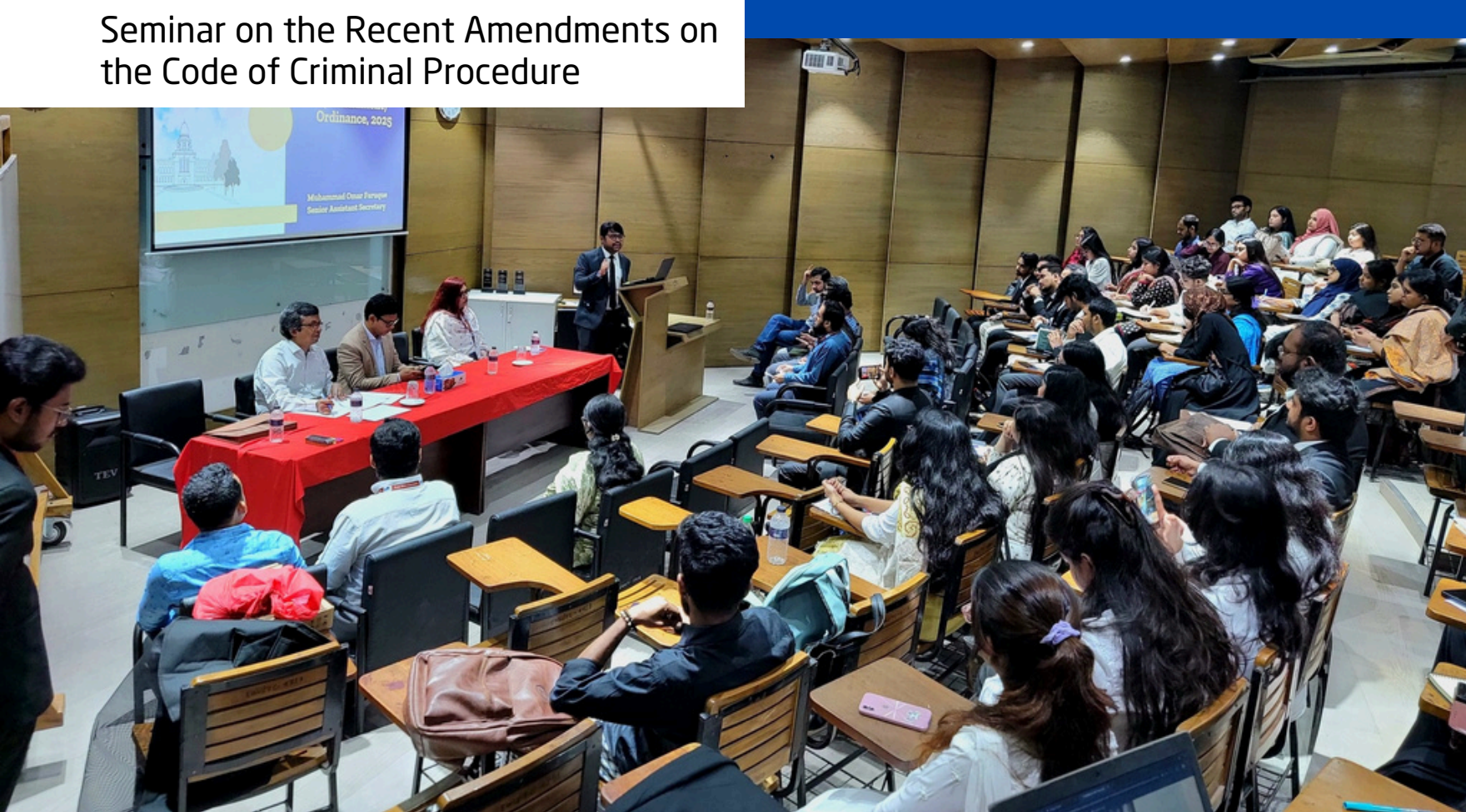
Seminar on the Recent Amendments on the Code of Criminal Procedure