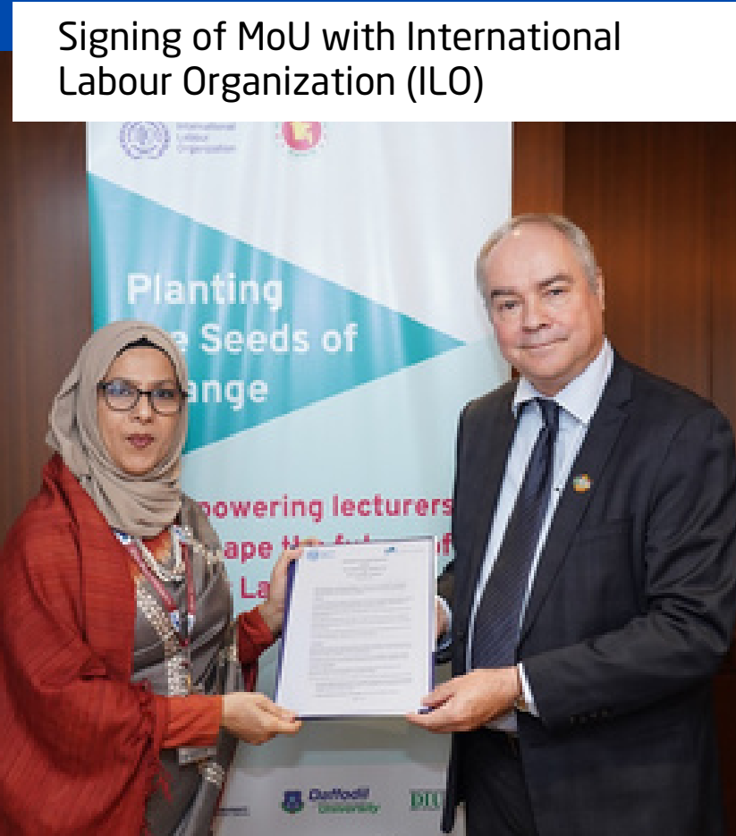
Signing of MoU with International Labour Organization (ILO)