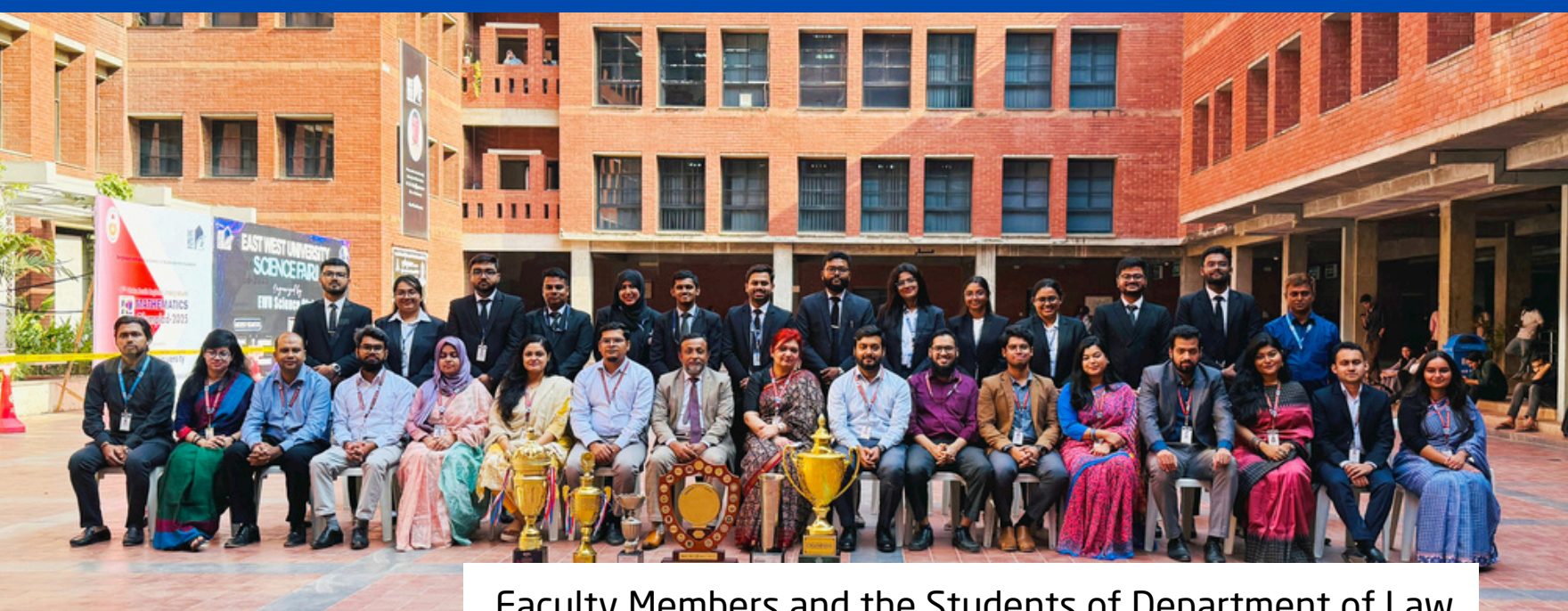
Faculty Members and the Students of Department of Law