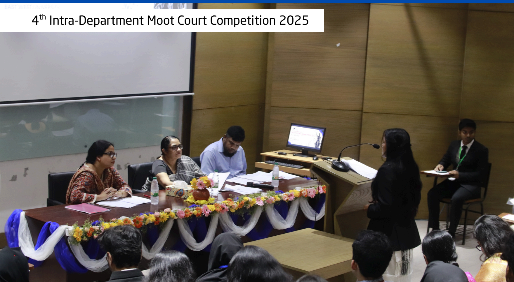
4th Intra-Department Moot Court Competition 2025