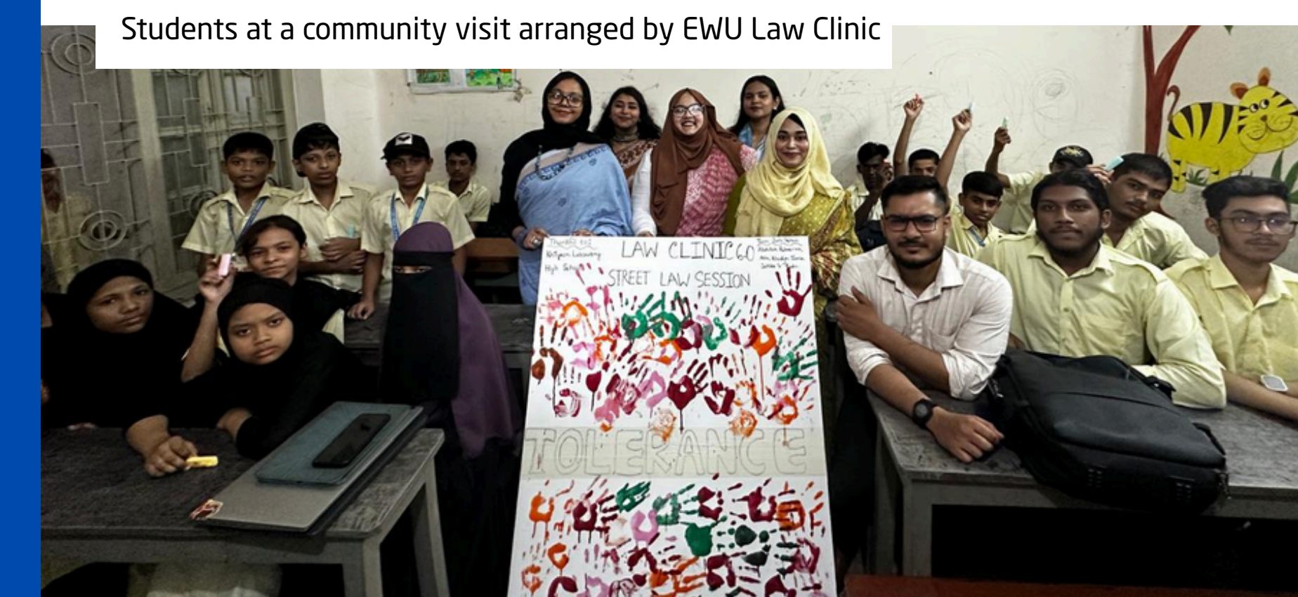
Students at a community visit arranged by EWU Law Clinic