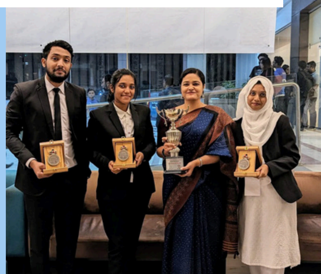
Henry Dunant Memorial Moot Court Competition 2023 (Runner Up)