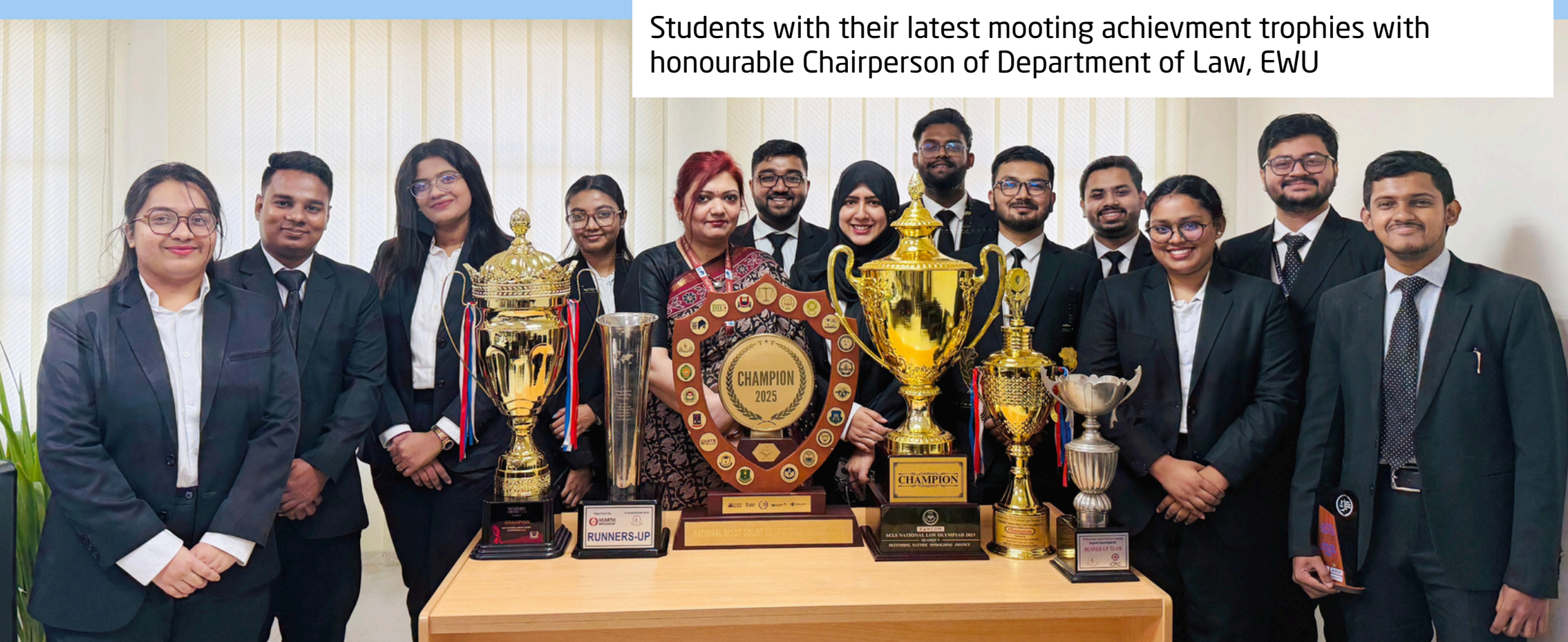
Students with their latest mooting achievement trophies with honourable Chairperson of Department of Law, EWU