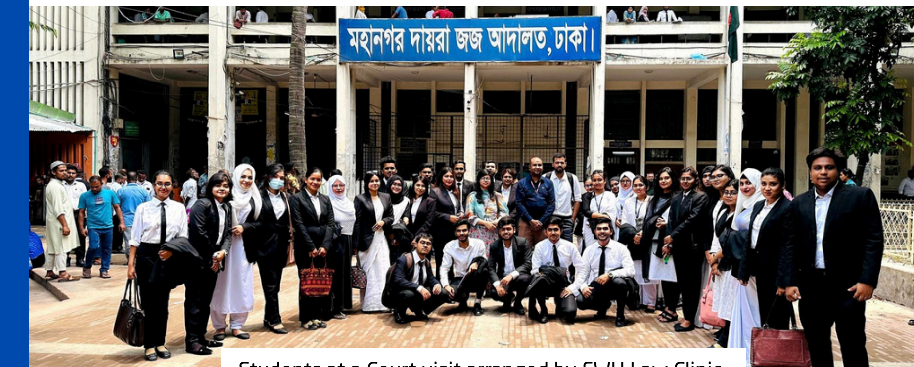
Students at a Court visit arranged by EWU Law Clinic

The EWU Law Clinic model is tailored to meet the educational goals, social justice needs, and professional requirements of Bangladesh. The students participate in civil and criminal mock trials, street law public literacy programs, community visits, and court visits as part of their assessment under the Law Clinic program.