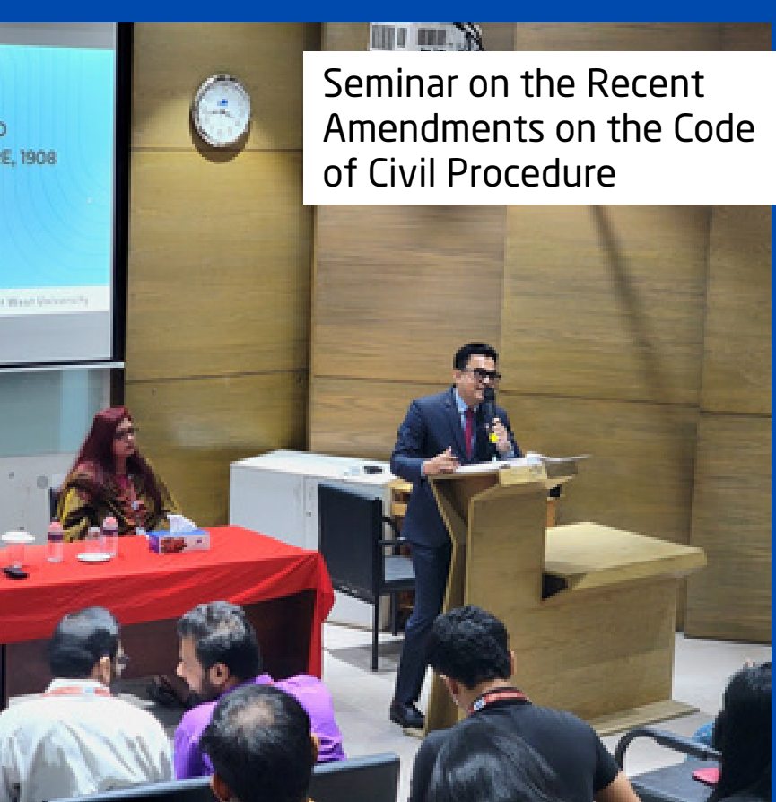
Seminar on the Recent Amendments on the Code of Civil Procedure