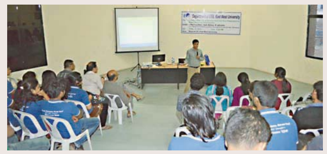
A part of the audience in the seminar on Trend in mobile chip development and your preparation to embrace career opportunities

Munich, Germany delivered a talk on "Trend in mobile chip development and your preparation to embrace career opportunities" on March 18, 2014.