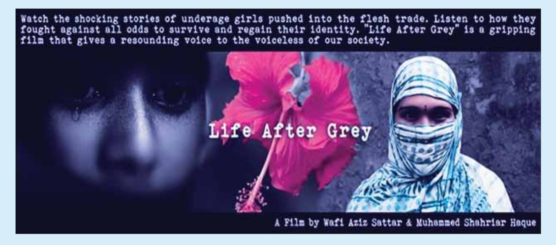
Figure 1: Poster of Life after Grey (Sattar & Haque, 2015)

Watch the shocking stories of underage girls pushed into the flesh-trade. Listen to how they fought against all odds to survive and regain their identity. Life after Grey is a gripping film that gives a resounding voice to the voiceless of our society.